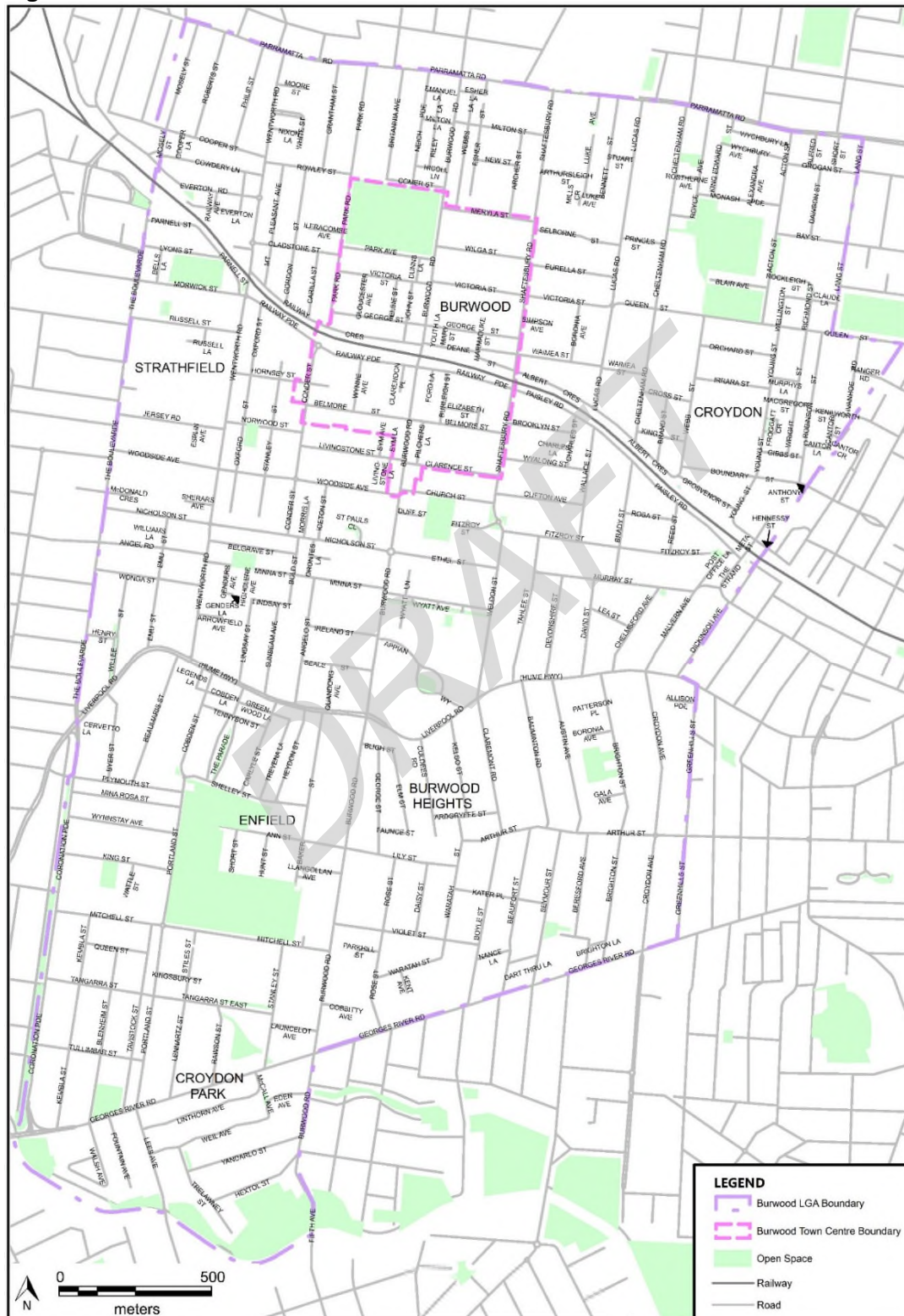
Figure 1 – The Burwood LGA and the Burwood Town Centre

This Plan applies to all land within the Burwood LGA as shown on the map in Figure 1.