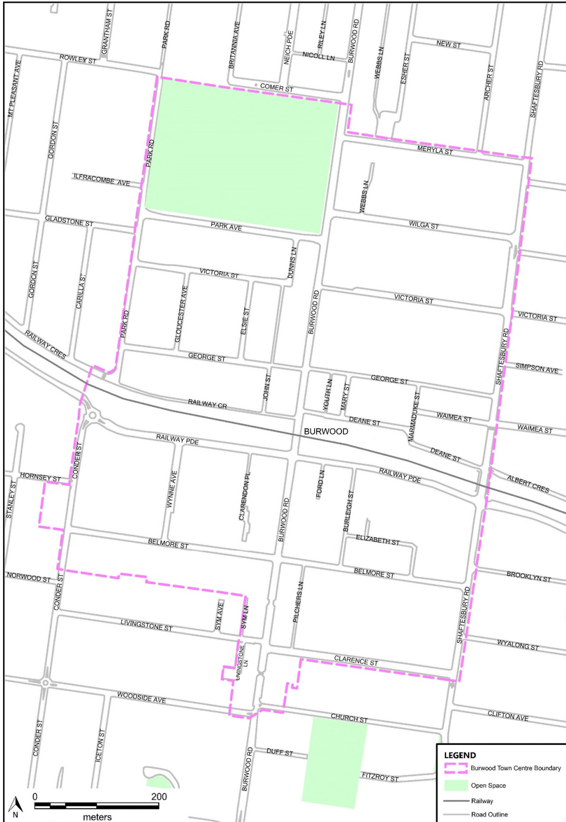
Figure 2 – Map of the Burwood Town Centre