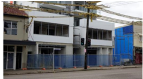
Example 2: Not Acceptable in Commercial Zones