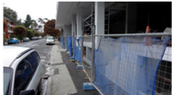
Example 4: Not Acceptable in Commercial Zones