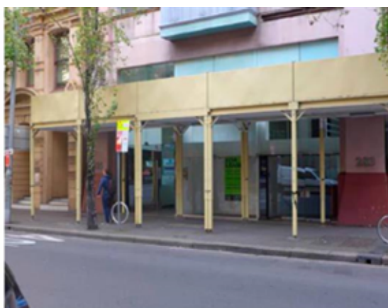
Example 11: Gantry Style – Acceptable in all zones