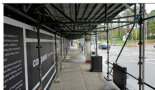
Example 16: Scaffolding Style – Not Acceptable in any zones