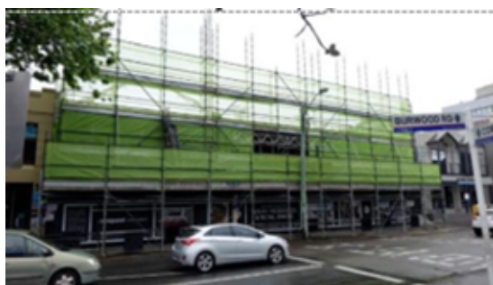
Example 15: Scaffolding Style – Not Acceptable in any zones