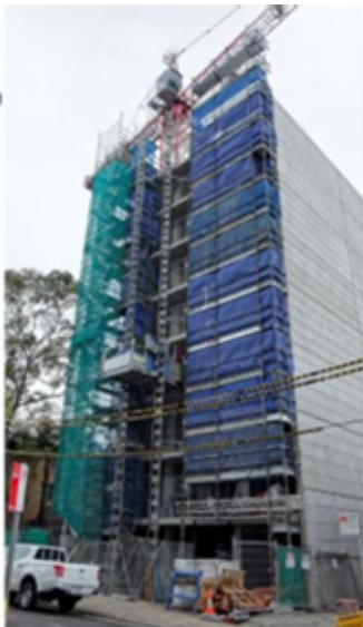
Example 3: Not Acceptable in Commercial Zones