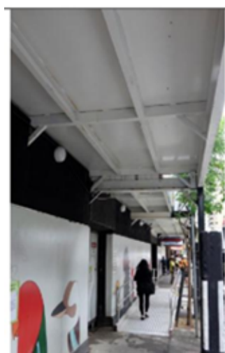
Example 14: Underside of hoarding must be painted white