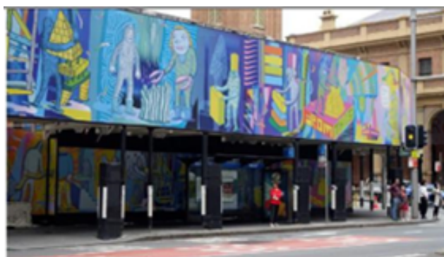
Example 12: Extended fascia to screen overhead sheds – Acceptable