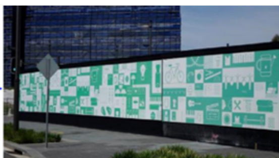
Example 9: Graphic Display – Acceptable in all zones; Mandatory in Commercial Zones