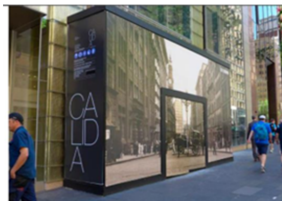
Example 8: Graphic display – Acceptable in all zones; Mandatory in Commercial Zones