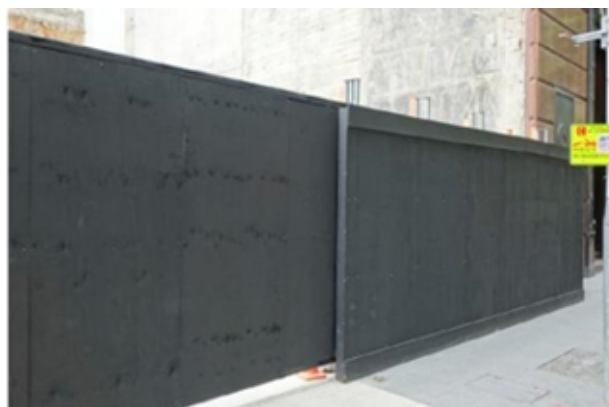
Example 6: Painted - Acceptable in Commercial Zones