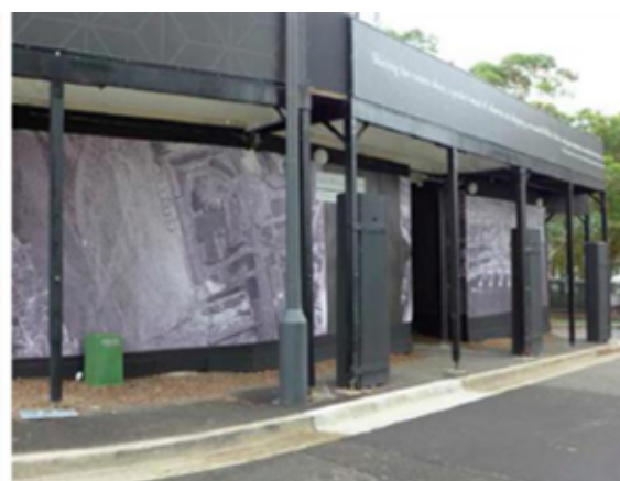
Example 13: Gantry Style – Acceptable in all zones