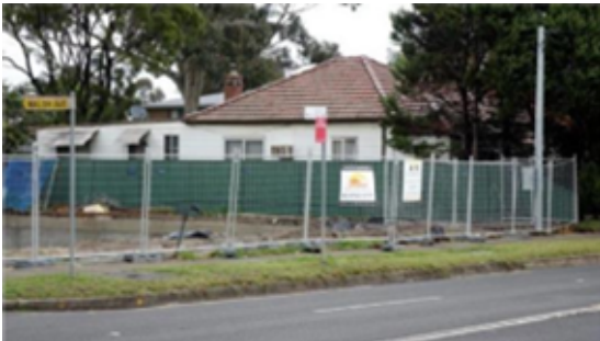
Example 1: Acceptable in Residential Zones only