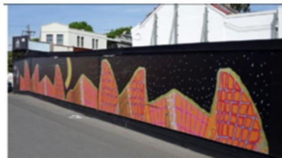
Example 10: Graphic Display – Acceptable in all zones; Mandatory in Commercial Zones