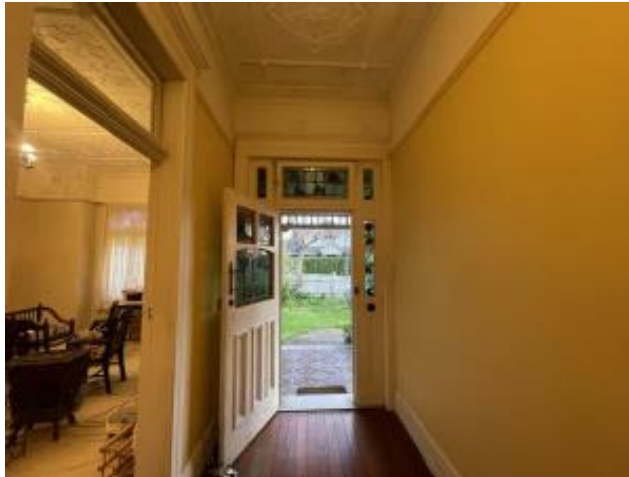
Figure 7: 27 Woodside Avenue entrance and detailing