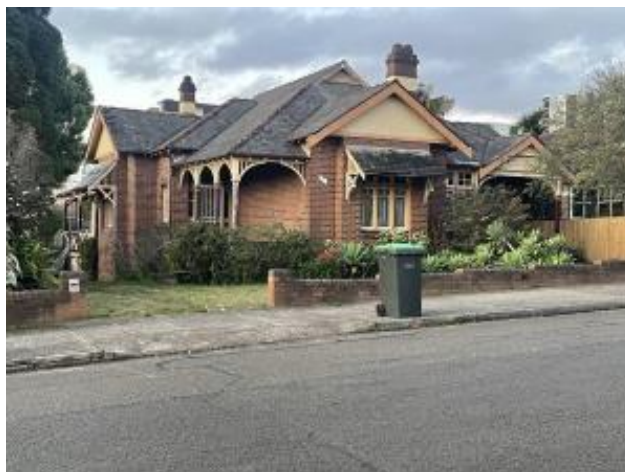
Figure 4: 25 Woodside Avenue view from street