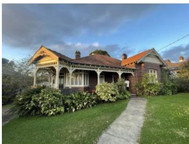
Figure 6: 27 Woodside Avenue view from street