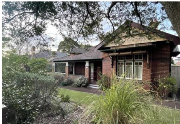
Figure 2: Southern Elevation of 23 Woodside Avenue view from street