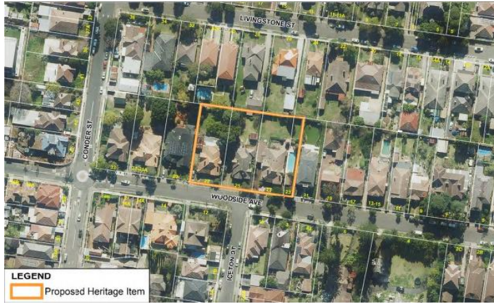
Figure 1: Proposed heritage sites (outlined in orange) and surrounds.