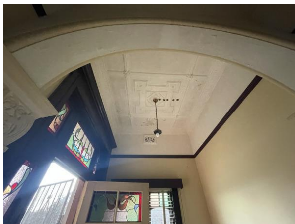
Figure 5: 25 Woodside Avenue entrance and ceiling detailing