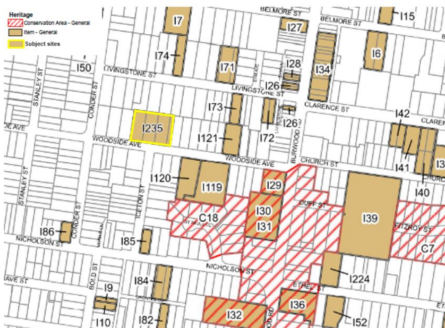
Figure 10: Draft Burwood LEP 2012 Heritage Map (proposed heritage sites outlined in yellow)