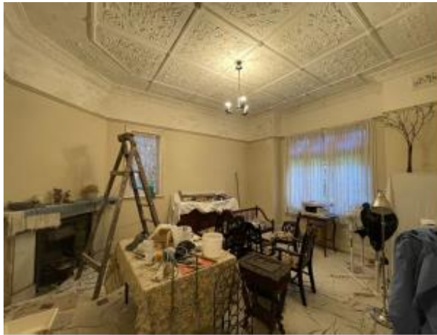
Figure 8: 27 Woodside Avenue reception room