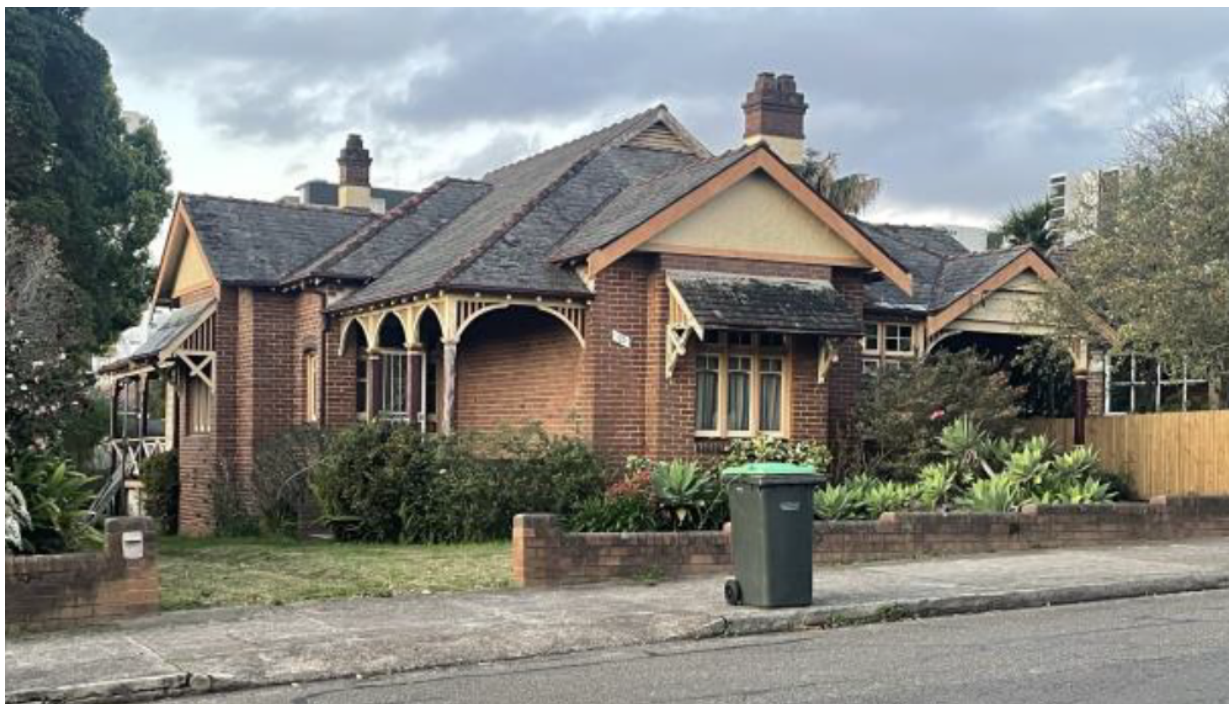
25 Woodside Avenue, Burwood