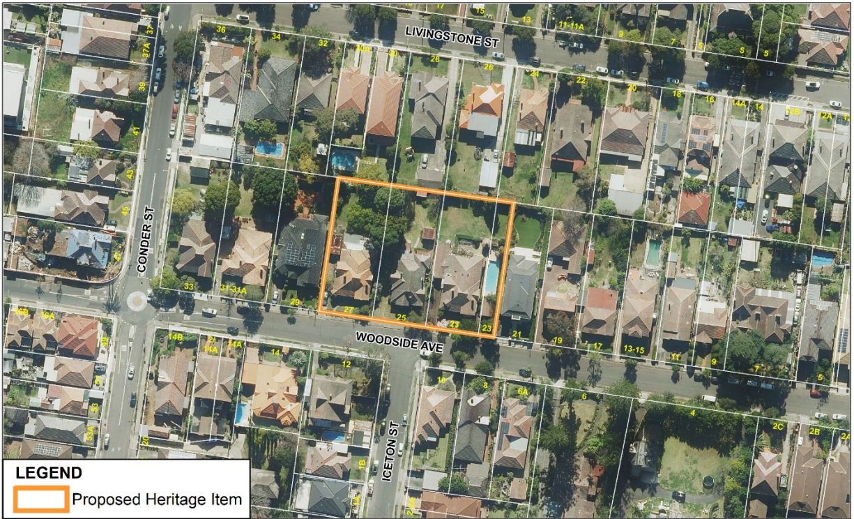
Figure 1. Aerial Photograph of subject properties at 23, 25 and 27 Woodside Avenue, Burwood.