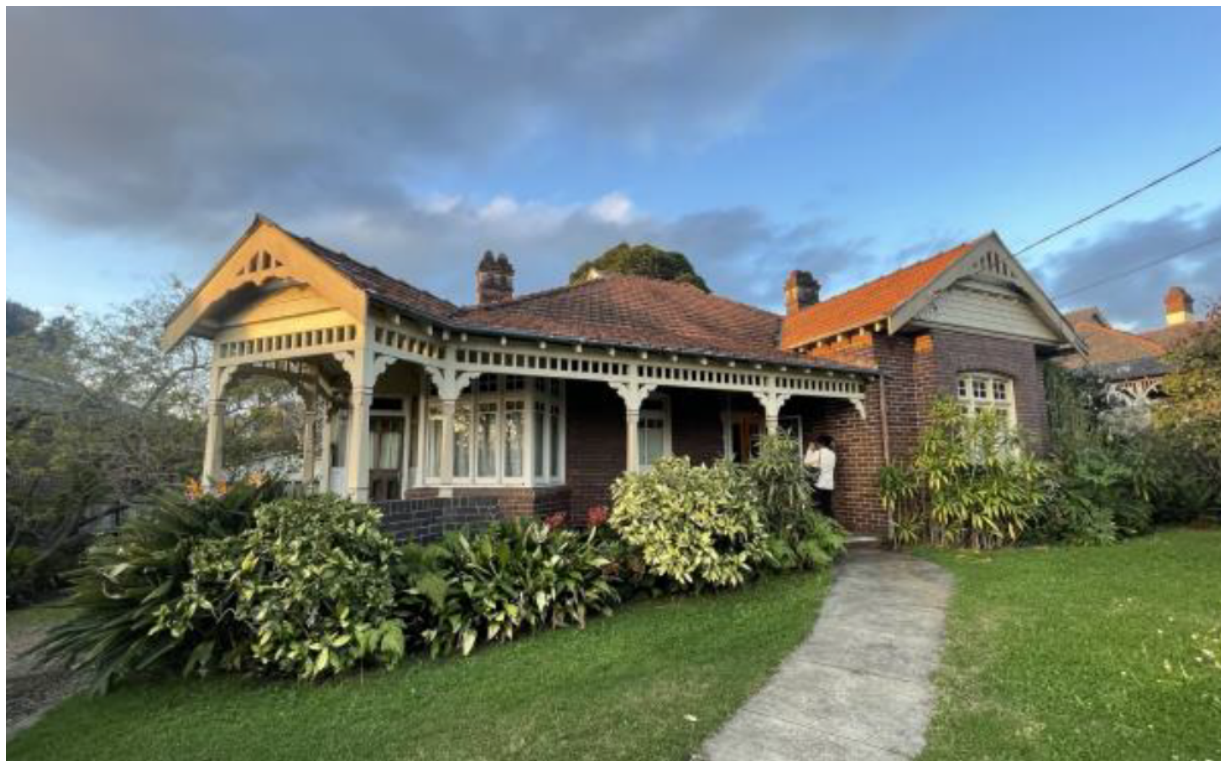
27 Woodside Avenue, Burwood