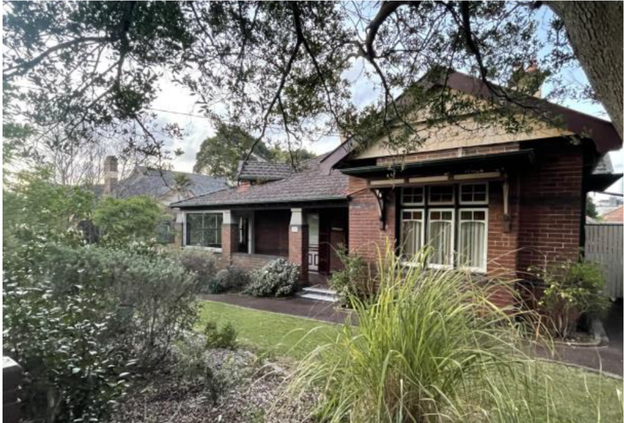
23 Woodside Avenue, Burwood